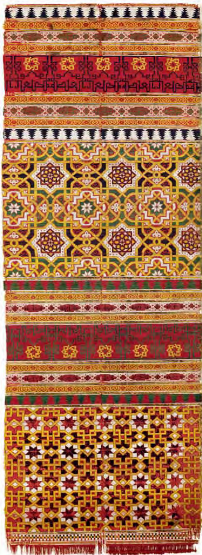
13. Textile fragment