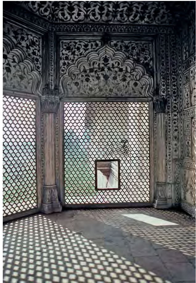
FIG. 18. Jali from the Khwabgah (royal bedroom) of the Lal Qil'a (Red Fort), Delhi, India, 1638–48

Screens like this are a hallmark of Mughal architecture. The Mughals were a Muslim dynasty of Central Asian origin who ruled the north of India from 1526 to 1858 (see “The Mughal Court and the Art of Observation,” page 153). Screens similar to this can be seen in their original settings in many Mughal palaces and mausoleums , like Fatehpur Sikri and the Taj Mahal. The weathered condition of this screen suggests that it was probably part of a series of similar screens used as windows set in an exterior wall.