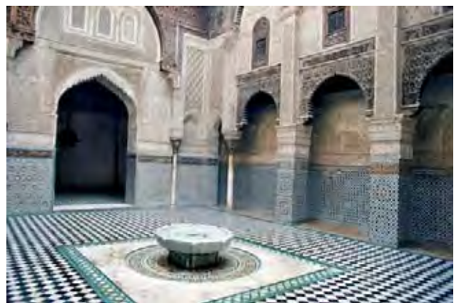
FIG. 16. Courtyard and fountain, ‘Attarin Madrasa, Fez, Morocco, 1323–25

Courtyards like this were typical of the architecture in fourteenth- and fifteenth-century Morocco and southern Spain (fig. 16). This courtyard was inspired by these and built and decorated onsite in 2011 by a team of Moroccan craftsmen from the city of Fez. The aim was to celebrate the excellence and enduring vitality of contemporary craftsmanship in the Islamic world. Morocco is one of the few countries in this vast region that has kept these centuries-old traditions alive and maintained them at the highest level. Every element of the courtyard was created with traditional techniques and materials, including the designs and colors of the tile panels, which are based on the wall panels ( dadoes ) of the Alhambra Palace in Granada, Spain (see fig. 22), built under Nasrid rule (1232–1492). Tiled dadoes like these are commonly seen in Islamic buildings throughout southern Spain and North Africa.