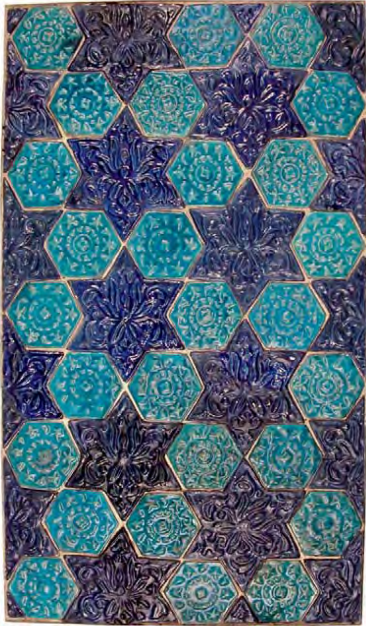
14. Star- and hexagonal-tile panel